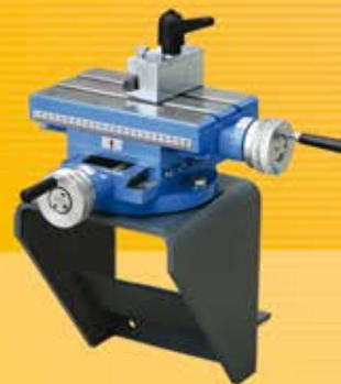
STANDART LATHE SUPPORT