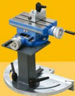
TURN TABLE LATHE SUPPORT