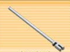
1 pcs bead straightening lever