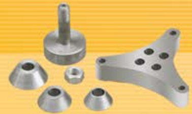
MOTOCYCLE FLANGE KIT