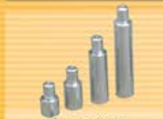
4 pcs piston lengthening arms